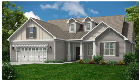
Optional Elevation B2