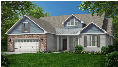
Standard Elevation A1

The Hamilton Bay offers that beautiful coastal home with a great open floor plan. A spacious kitchen with entertaining island opens up to a great room and dining room with tray ceilings. Expansive doors lead out to a large screened loggia with adjacent patio to enjoy the coastal weather. A private master suite features his and hers walk-in closets, his and hers vanities, and a large spa-like walk-in shower. Three guest bedrooms and a second floor optional flex room allows for plenty of space and storage.