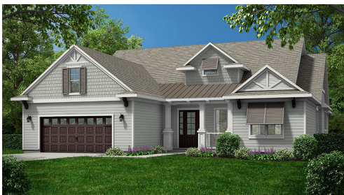
Optional Elevation D4