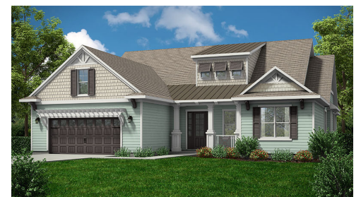
Optional Elevation E5