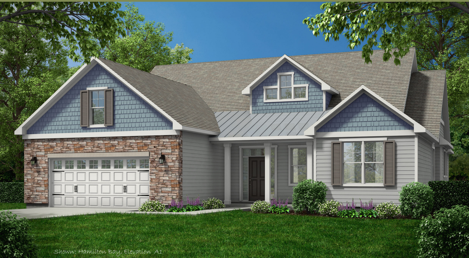
Shown: Hamilton Bay, Elevation A1