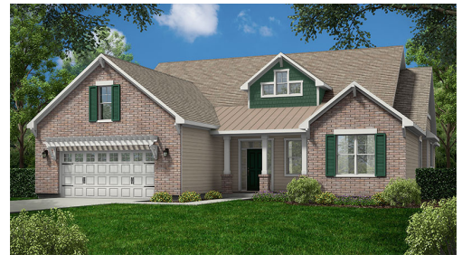
Optional Elevation C3