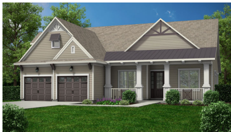
Optional Elevation D4