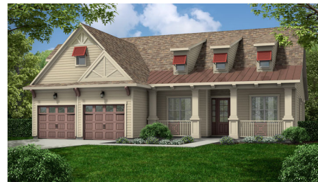
Optional Elevation E5