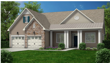
Standard Elevation A1

The Siesta Bay offers that beautiful coastal home with a great open floor plan. A spacious kitchen with entertaining island opens up to a vaulted great room and dining room with a tray ceiling. Expansive doors lead out to a large screened loggia with adjacent patio to enjoy the coastal weather. A private master suite features a large walk-in closet, his and hers vanities, and a large spa-like walk-in shower. A study, two guest bedrooms, and a second floor optional flex room and bath allows for plenty of space and storage.