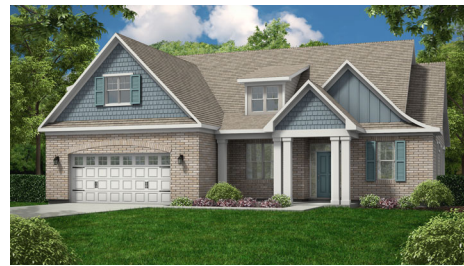
Optional Elevation C3