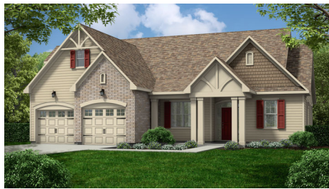
Optional Elevation B2