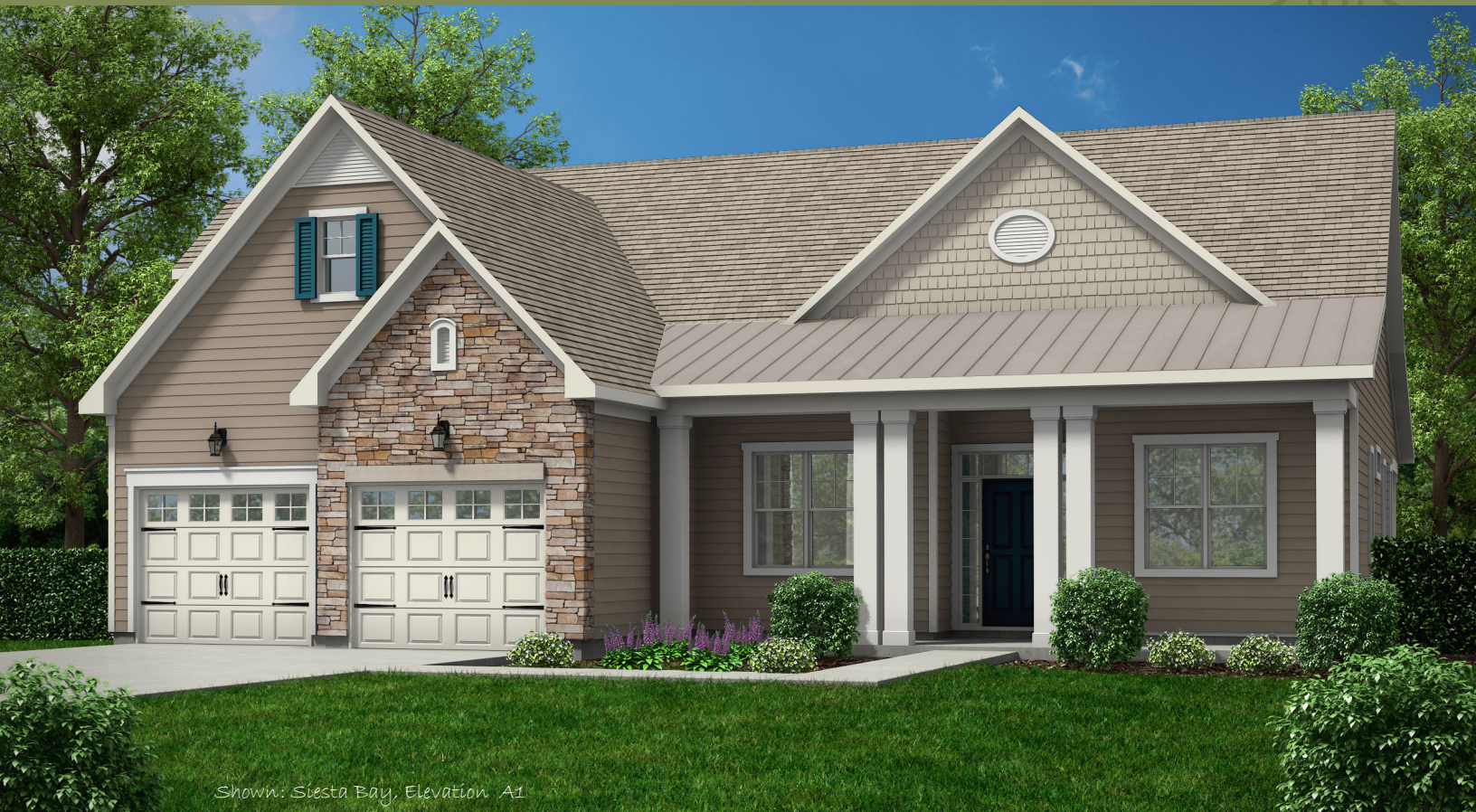
Shown: Siesta Bay, Elevation A1