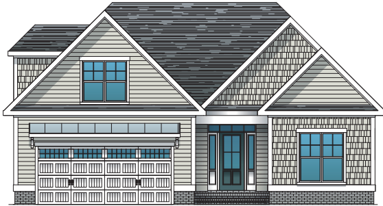
D 2129 SF