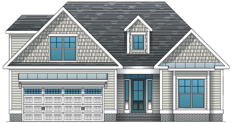
C 2136 SF