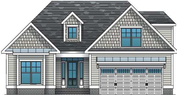
C 2136 SF