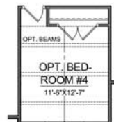
OPTIONAL BEDROOM #4