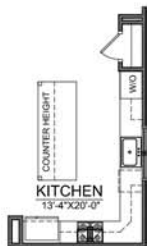
OPTIONAL PRESTIGE KITCHEN