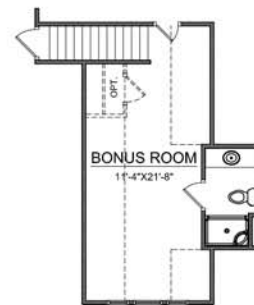
OPT. BONUS ROOM w/ BATHROOM