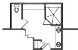
OPTIONAL MASTER BATH #2